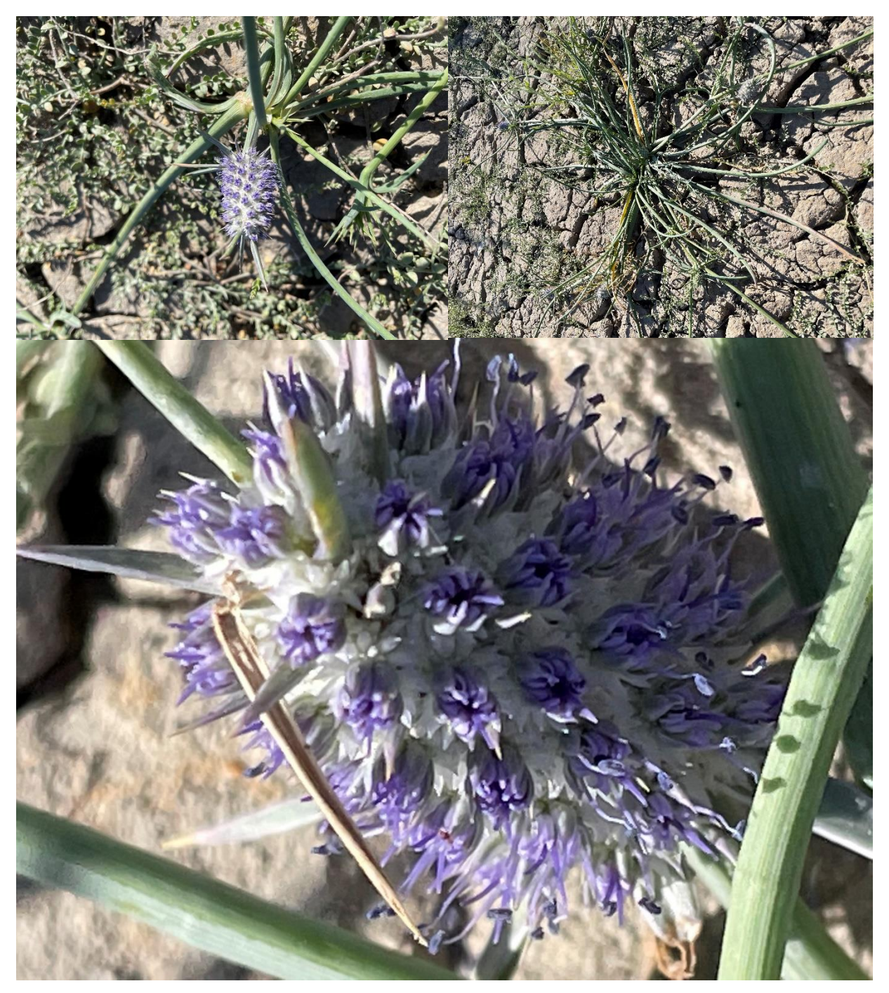
Pictures: Long Eryngium recently spotted on the Pike Floodplain.

This native species is related to three other native Eryngiums (Blue, White and Little Devils) and one weedy Eryngium, as well as the European Sea Holly that is used in floristry. Have you spotted any recently? Let us know.